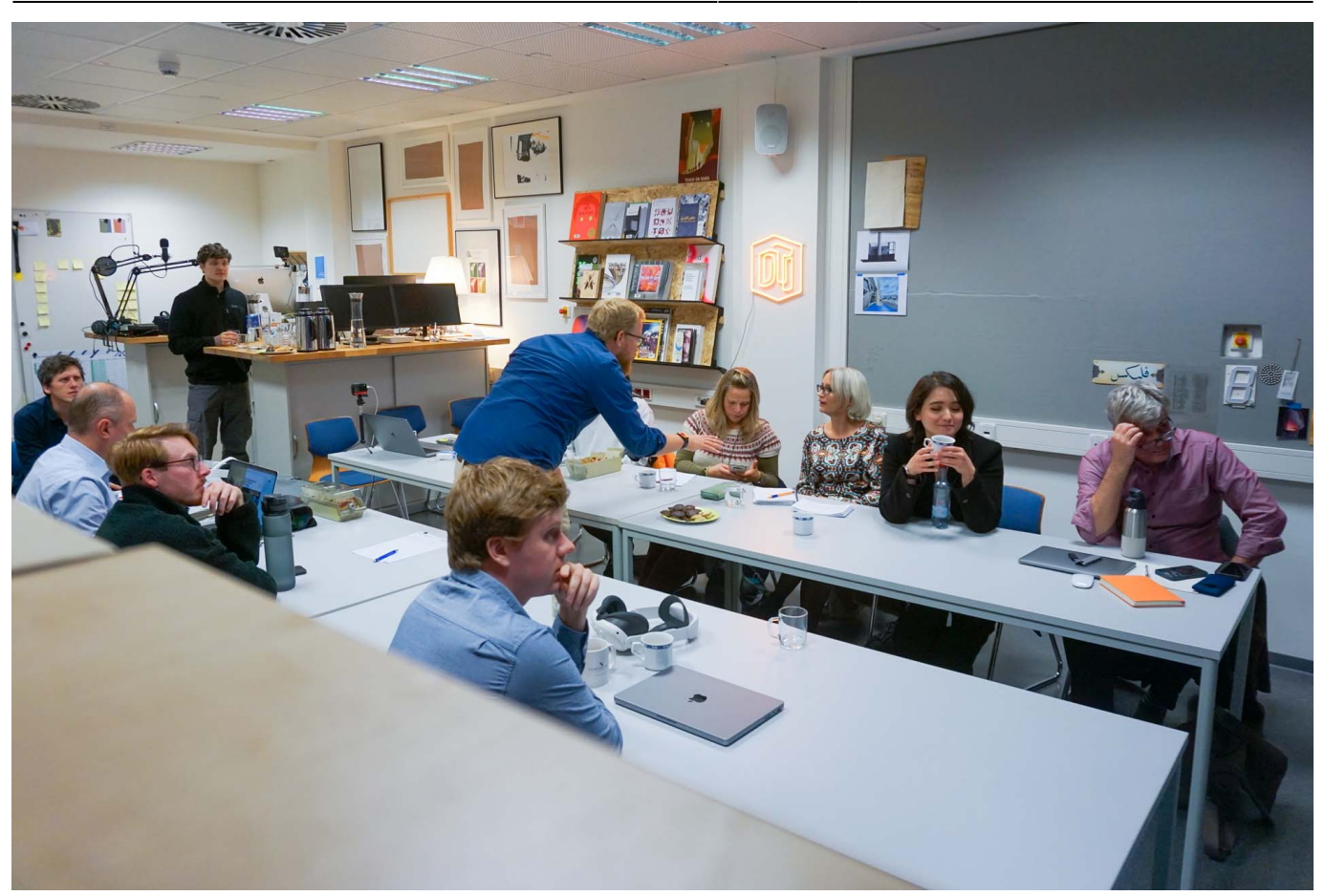
The Green Weave 06/2022-04/2024

Production processes of traditional artistic handicrafts in several rural areas in the North-West of India are being analysed and examined. Main focus is to research the potential to up-cycle relating production processes including less pollution and less carbon monoxide emissions. Together with the project partner Dharma Life Labs and their sponsoring project partner IKEA Foundation the overall goal is to improve the lives of children by enabling their families to create sustainable livelihoods, and fight and cope with climate change.