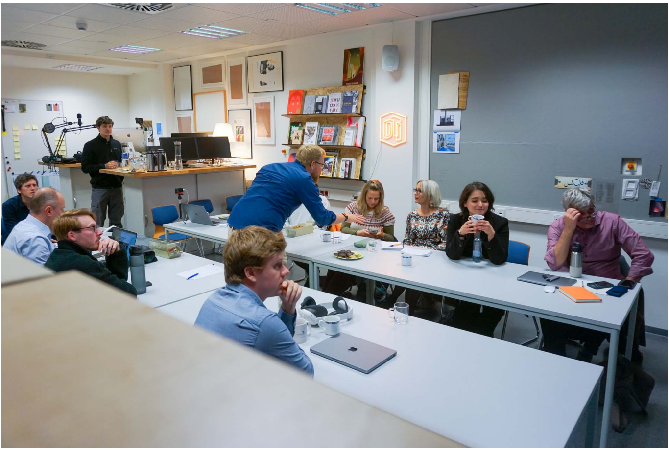
The Green Weave 06/2022-04/2024

Production processes of traditional artistic handicrafts in several rural areas in the North-West of India are being analysed and examined. Main focus is to research the potential to up-cycle relating production processes including less pollution and less carbon monoxide emissions. Together with the project partner Dharma Life Labs and their sponsoring project partner IKEA Foundation the overall goal is to improve the lives of children by enabling their families to create sustainable livelihoods, and fight and cope with climate change.