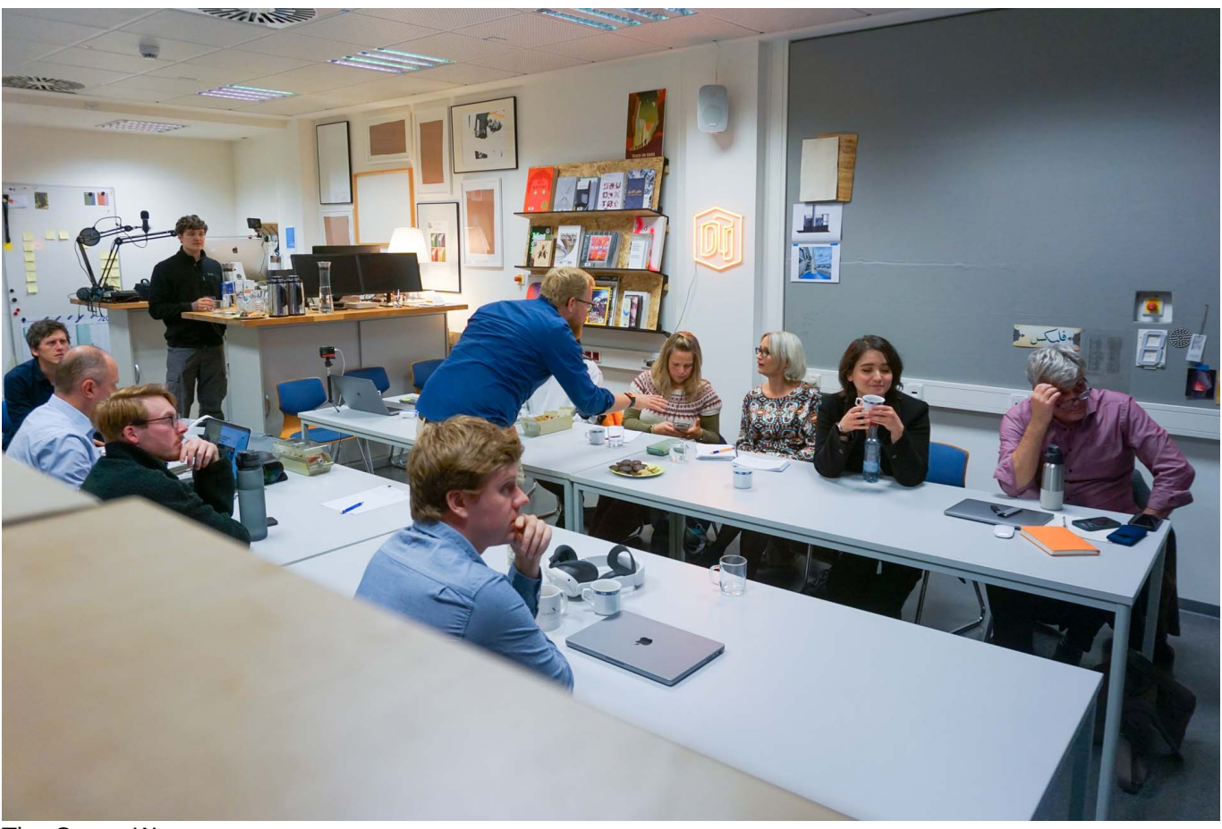
The Green Weave 06/2022-04/2024

Production processes of traditional artistic handicrafts in several rural areas in the North-West of India are being analysed and examined. Main focus is to research the potential to up-cycle relating production processes including less pollution and less carbon monoxide emissions. Together with the project partner Dharma Life Labs and their sponsoring project partner IKEA Foundation the overall goal is to improve the lives of children by enabling their families to create sustainable livelihoods, and fight and cope with climate change.