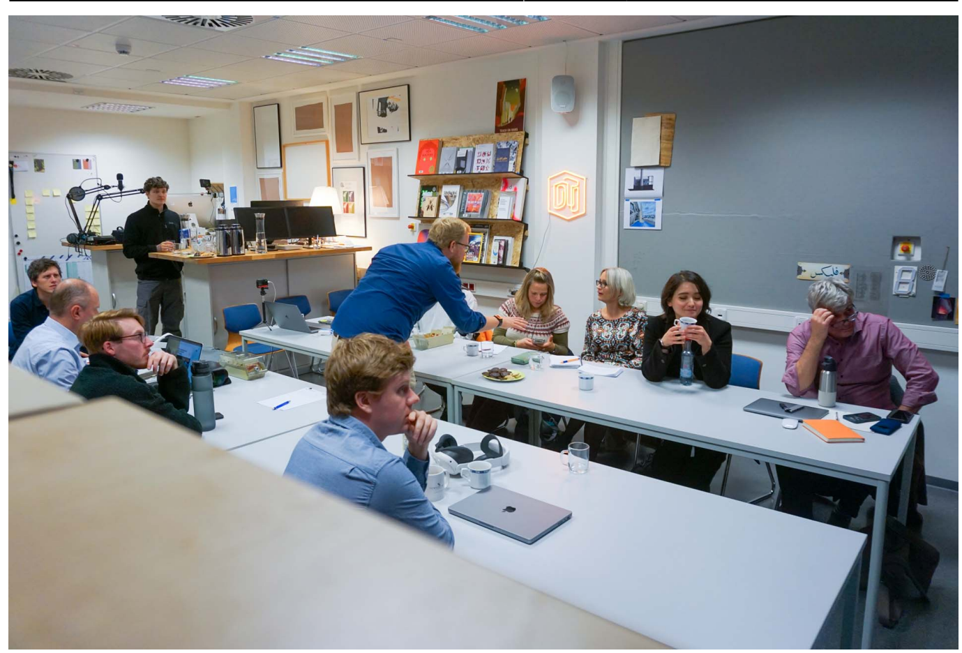
The Green Weave 06/2022-04/2024

Production processes of traditional artistic handicrafts in several rural areas in the North-West of India are being analysed and examined. Main focus is to research the potential to up-cycle relating production processes including less pollution and less carbon monoxide emissions. Together with the project partner Dharma Life Labs and their sponsoring project partner IKEA Foundation the overall goal is to improve the lives of children by enabling their families to create sustainable livelihoods, and fight and cope with climate change.