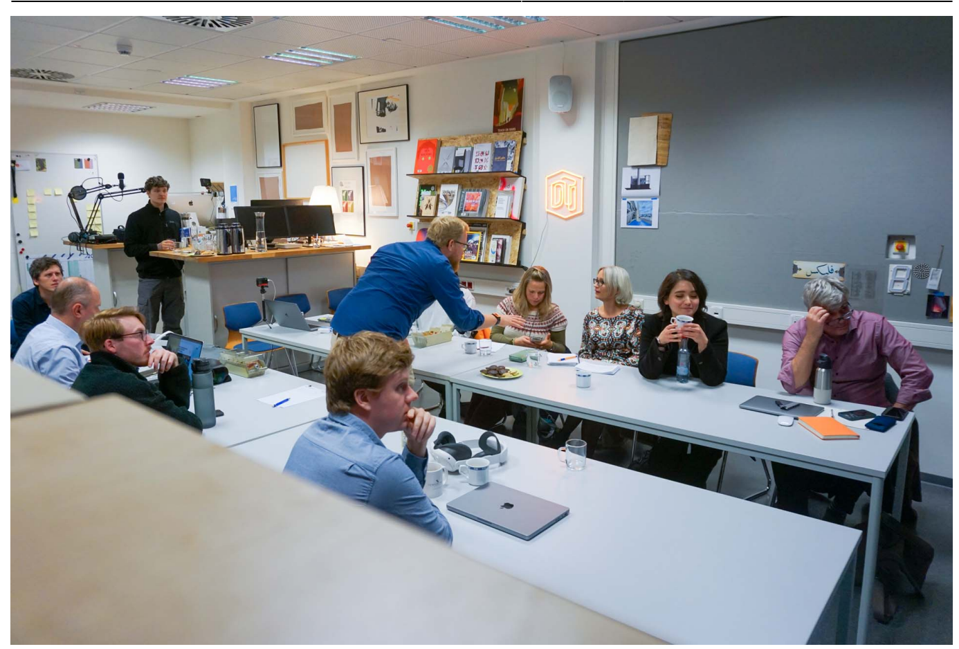
The Green Weave 06/2022-04/2024

Production processes of traditional artistic handicrafts in several rural areas in the North-West of India are being analysed and examined. Main focus is to research the potential to up-cycle relating production processes including less pollution and less carbon monoxide emissions. Together with the project partner Dharma Life Labs and their sponsoring project partner IKEA Foundation the overall goal is to improve the lives of children by enabling their families to create sustainable livelihoods, and fight and cope with climate change.